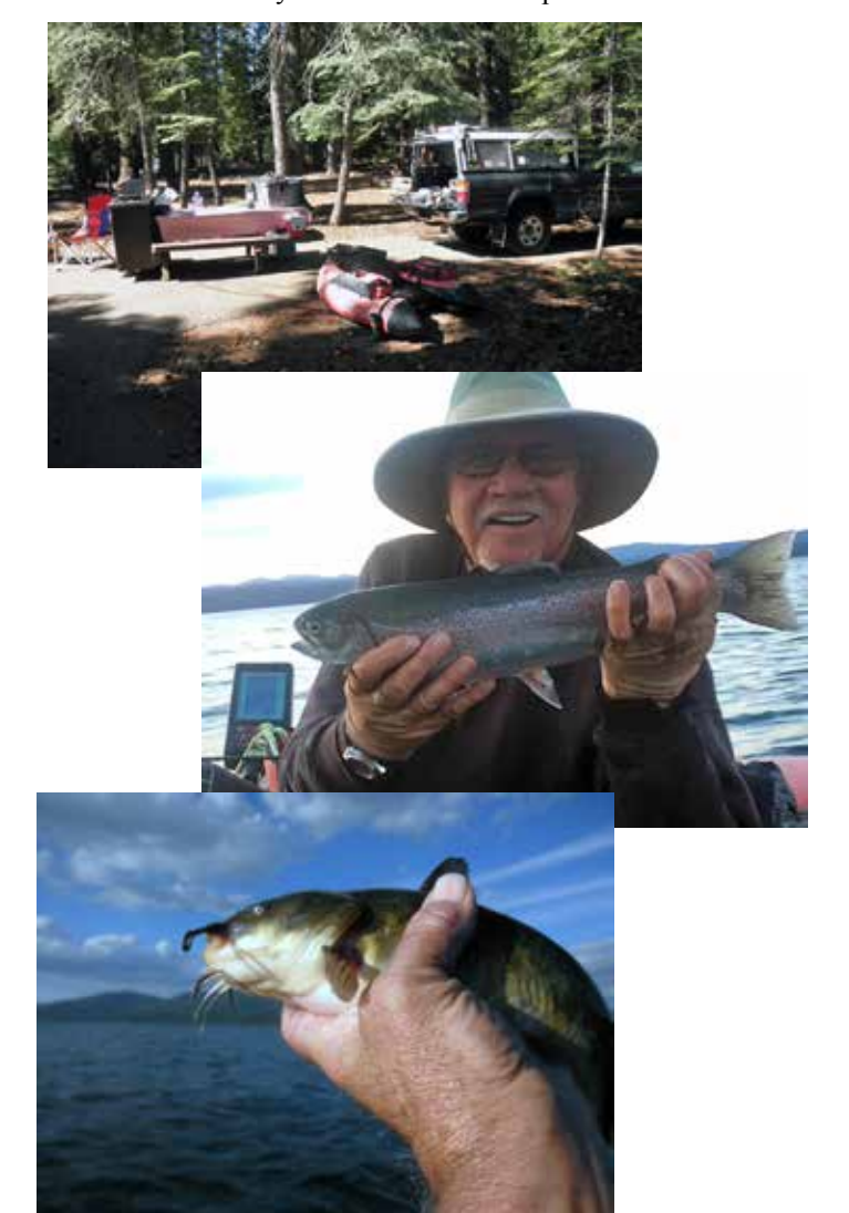
6 Santa Cruz Fly Fishermen

JT and Yog fished with me one night and I promised them better luck than they had the night before at Geritol Cove. The both of them were on fire with bent rods and some really nice rainbows and browns. The magnificent Hex flies were popping up on the surface in great numbers and the bats and geese were gorging themselves, one bat flew into my fly rod, a first that startled me a little bit. I was sad that my campsite was reserved and I had to leave on Friday or I would have hung out another week, it was so nice there, but my truck engine had the check engine light on most of the 600-mile round trip and starting it in the mornings was a chore. It made it home okay, even though I avoided the bay area completely and took I-5 all the way south to the Los Banos exit and over Pacheco pass to stay out of the mess we all know an approaching holiday creates. I hope to reserve a couple campsites on the lake next year and it should be great time for all who join us there.